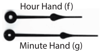
Hour Hand (f)