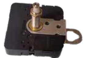
Clock with hanger on (k)

Once again, congratulations on your milestone, and we wish you many years of contented sobriety.