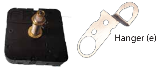
Clock mechanism (d)